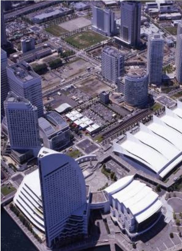
Pacific Yokohama Annex Hall