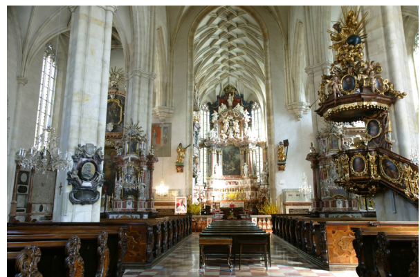
The Cathedral Interior