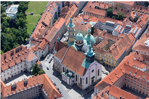
The Cathedral ( https://www.graztourismus.at )

The objective of the conference is to provide a forum for academic and industrial researchers to meet and exchange valuable experiences in the field of thermophysical properties for a wide variety of systems covering fluids and solids. The conference will concentrate mainly on measurement, theory and modeling of the following properties and materials.