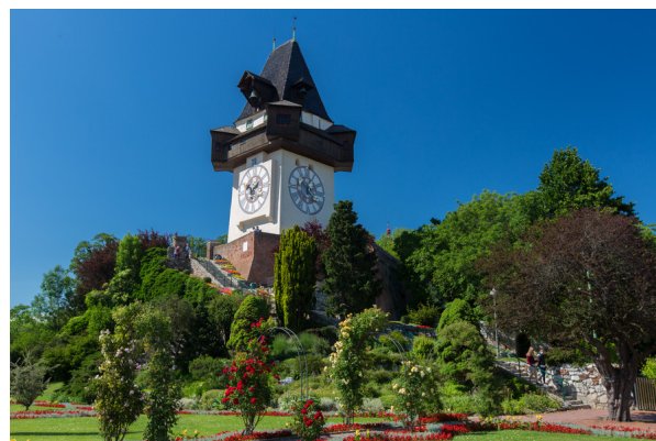
Schlossberg Uhrturm