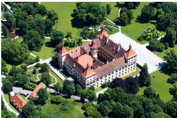
Schloss Eggenberg ( https://www.graztourismus.at )

Graz had grown enough to be designated capital of "Inner Austria", an area that comprised Styria and Carinthia, along with Carniola, Inner Istria and Trieste (now parts of present-day Slovenia, Croatia and Italy). As the capital of Inner Austria, Graz was residence to Habsburg dynasty until 1619.